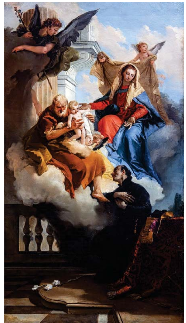
Saint Cajetan's Vision of the Holy Family by Giambattista Tiepolo Gallerie Accademia, Venice Italy

Nor, my child, must you receive Jesus Christ simply as a means to further your own plans; I want you to surrender to him, that he may welcome you and, as your divine Savior, do to you and in you whatever he wills. This is what I want, this is what I beg of you, this, as far as I can, is what I compel you to do."